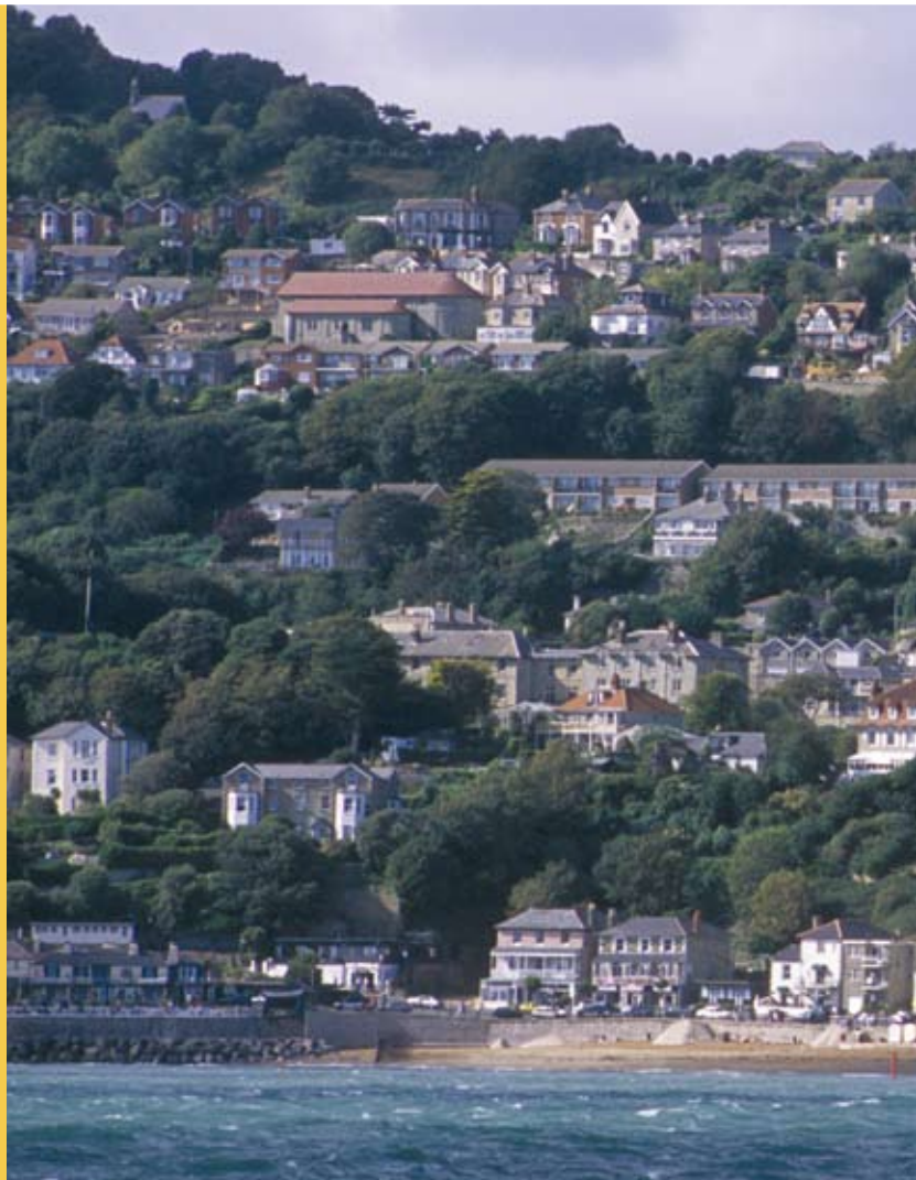
Isle of Wight HEAP areas

You can read all the HEAP documents at www.iwight.com/living_here/planning/Archaeology/historic.asp or telephone 01983 823810 for printed copies.