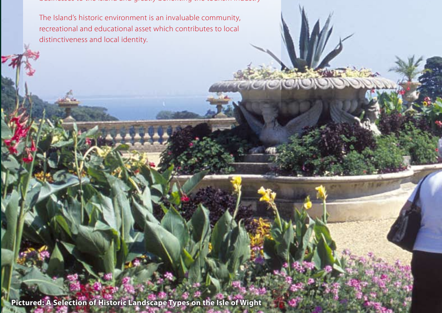
Pictured: A Selection of Historic Landscape Types on the Isle of Wight

The Island's historic environment is an invaluable community, recreational and educational asset which contributes to local distinctiveness and local identity.