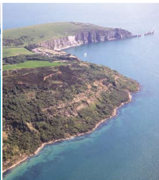
Views taken within some of the Island's varied HEAP areas