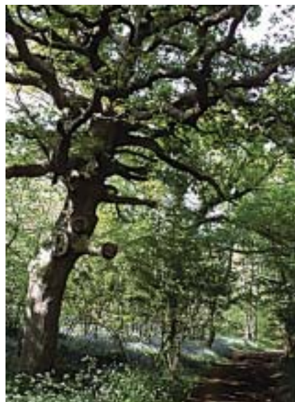
Borthwood Copse

A key stakeholder with whom the Forestry Commission will be consulting with is the Isle of Wight AONB Partnership. Forestry operations can have significant influence on landscape character, determining textures, colours, shapes and patterns. For example the darker evergreen pointed tops of some conifer trees contrast with lighter deciduous rounded tops of broadleaf's. Clear fells in particular are a key challenge. They create temporary open