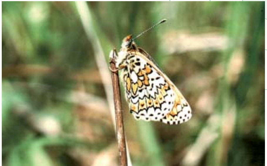
An Island Speciality, the Glanville Fritillary butterfly found on soft cliffs around the coast.

rich in wildlife. Crumbling, south-facing cliffs are home to the Island's special butterfly, the Glanville Fritillary, together with a host of other, less showy, warmth-loving insects. Estuaries on the north coast have a rich mix of habitats - saltmarshes, shingle ridges, mudflats, old meadows and ancient woodlands stretching down to the shore, each with a wealth of wildlife.