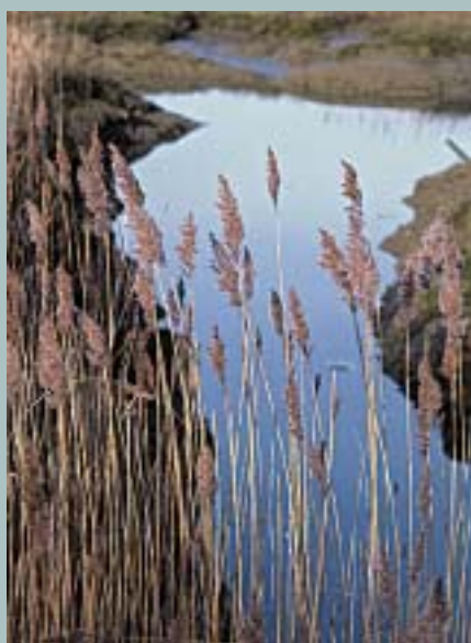
Reed Fringed mudflats on one of our quiet creeks on the north coast.

Areas of land of special scientific interest by reason of its fauna, flora or geological or physiographical features, notified by English Nature under the Wildlife and Countryside Act 1981. Consultation with English Nature is required if works are proposed which could damage the scientific value of features in this area.