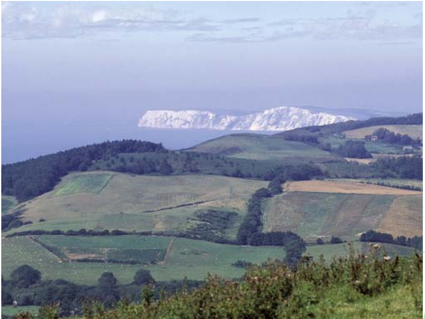
View from Limerstone Down

T HE spring and early summer months are my personal favourite time of year – The vigour of new growth of previously dormant plants and the playful antics of young livestock making their first steps in life, all contribute to a great sense of vitality to the Island's finest landscapes. The special clarity of light and the more temperate winds herald the awakening of the AONB from its winter slumber welcoming all who are now venturing out to enjoy its special qualities and natural beauty.