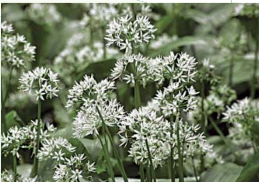
Ramsons or wild garlic create spectacular floral carpets in woods on the chalk in the spring.

Ecology Officer, Isle of Wight Council ■