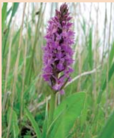
Marsh Orchid

A local environmental consultant has been working with Island Waste Services for the last 5 years monitoring the translocated wetland site. Having completed this study the consultant now undertakes a monthly survey of the entire site. This entails monitoring the progress of the numerous trees that have been planted all over the site and keeping a record of all noteworthy plant and animal species observed. During the last year this has included 41 species of birds, 16 species of butterfly and 8 species of dragonfly and damselfly. The monthly reports received are supplemented by observations made by the landfill site manager and supervisor.