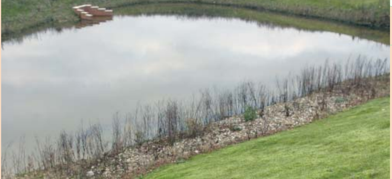
Attenuation pond at Standen Heath landfill site

THE ISLAND has a strong commitment towards recycling this is reflected by the recent short-listing of the Isle of Wight Council as a beacon authority for its waste and recycling services.