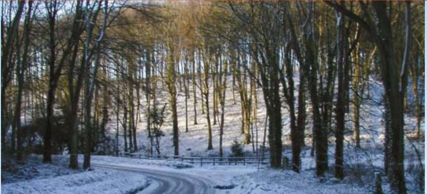
Lynch Lane in the snow.