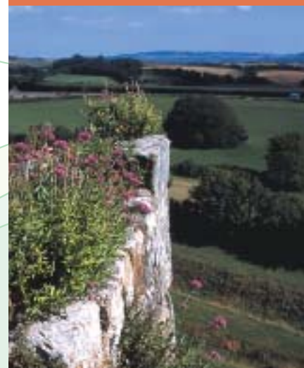
View from Carisbrooke Castle towards Whitcombe

To find out more details, contact us at the AONB Unit on (01983) 823855 or by e-mail aonb@iow.gov.uk ■