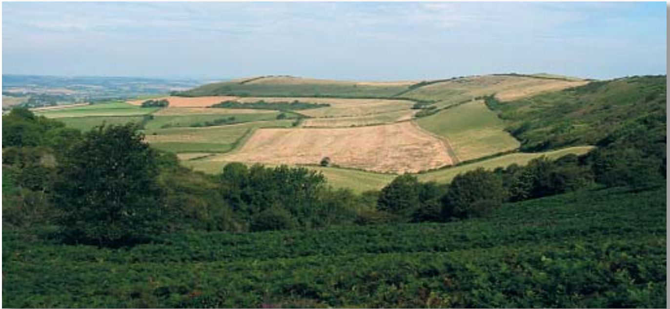
St Martin's Down looking from Ventnor Down

I feel very privileged to be working to help to keep our finest landscapes special. Since boyhood I have had a deep passion for this special place and a rightful pride of the Island, its history, land and seascapes and their subtleties. With this comes a strong desire to share my impressions and reflections with family, friends and visitors to our county.