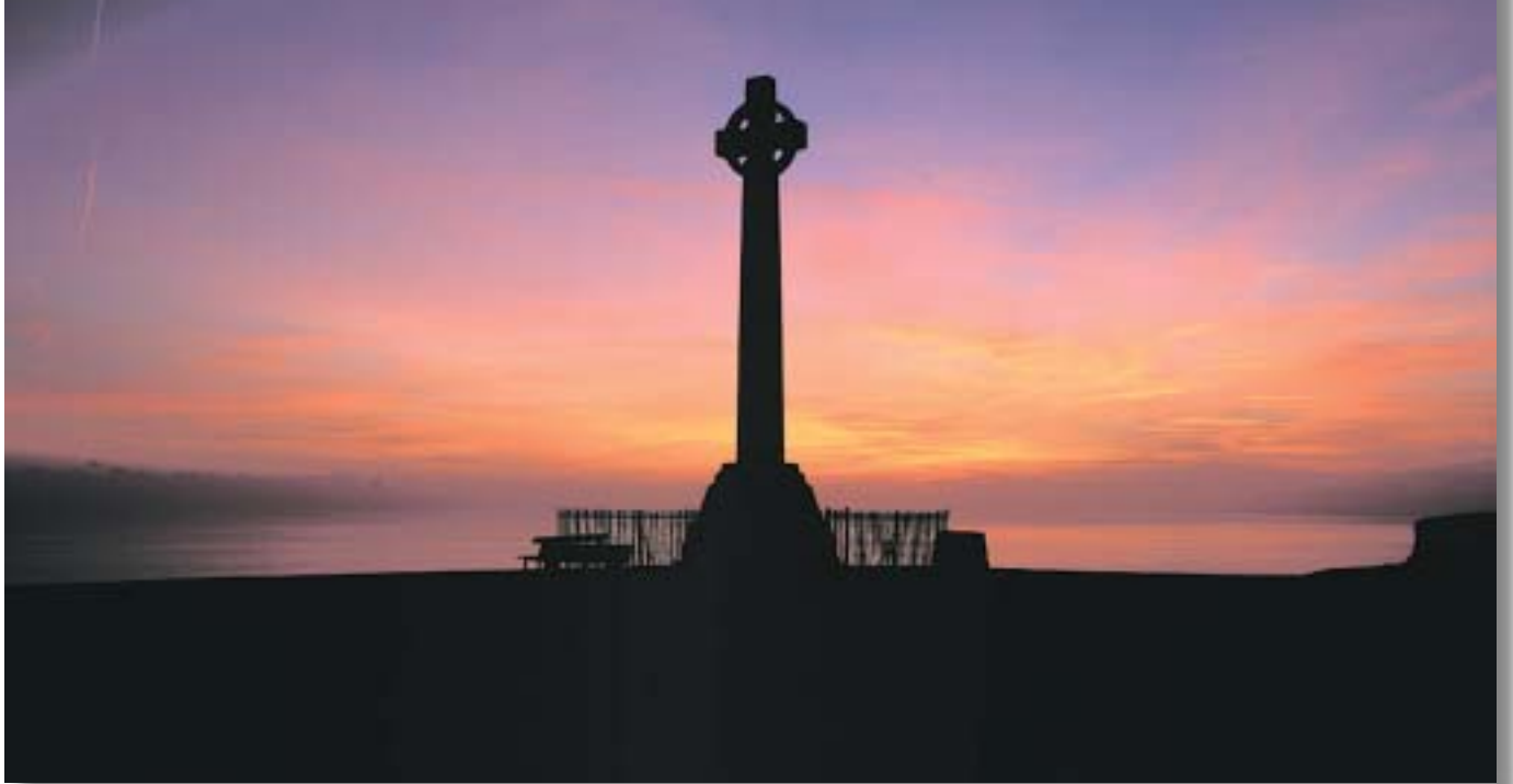
Tennyson Memorial at sunset – Christmas Eve 2001